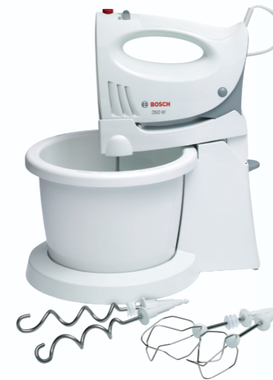
Hand Mixer with Rotating Bowl